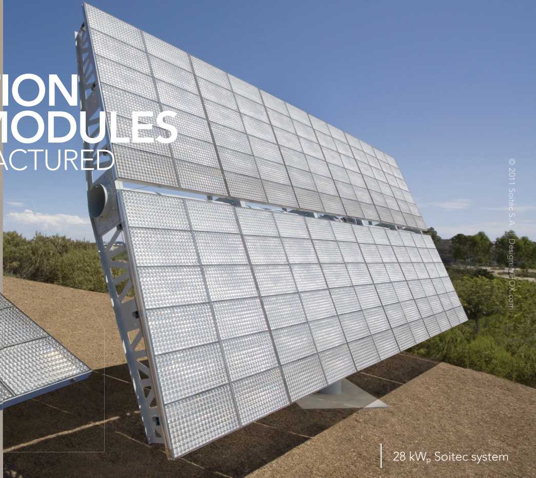
28 kW p Soitec system