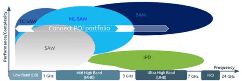
Connect POI portfolio within the RF filter technology landscape